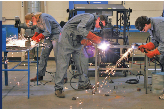
Joint School District No. 2 West Ada Career Technical Education Office 1303 E. Central Drive Meridian, Idaho 83642

CTE courses provide a hands-on learning experience for students, which ultimately helps build industry knowledge and confidence. Students will have the opportunity to demonstrate their learned trade and build leadership skills. Most pathways offer ways to earn college credit, industry certifications or engage in local externships and career exploration opportunities.